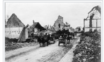
Damage and destruction of civilian buildings in Belgium, 1914 [edit]

One of the features of total war in Britain was the use of government propaganda posters to divert all attention to the war on the home front . Posters were used to influence public opinion about what to eat and what occupations to take, and to change the attitude of support towards the war effort. Even the Music Hall was used as propaganda, with propaganda songs aimed at recruitment.