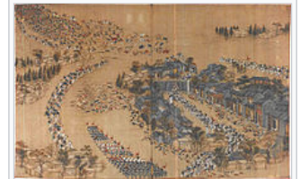
A scene of the Taiping Rebellion [edit]

The Taiping Rebellion (1850–1864) was one of the deadliest wars in history. [15] About 20 million people died, many due to disease and famine . [16] It followed the secession of the Taiping Heavenly Kingdom from the Qing Empire . [17] Almost every citizen of the Heavenly Kingdom was given military training and conscripted into the army to fight against the Imperial forces. [17]