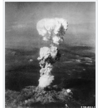
The mushroom cloud produced by the atomic bombing of the city of Hiroshima during World War II . The bombing was an act of total war.

From this moment until such time as its enemies shall have been driven from the soil of the Republic all Frenchmen are in permanent requisition for the services of the armies. The young men shall fight; the married men shall forge arms and transport provisions ; the women shall make tents and clothes and shall serve in the hospitals; the children shall turn old lint into linen; the old men shall betake themselves to the public squares in order to