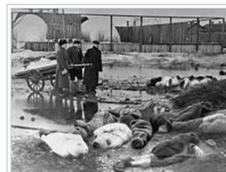
Three men burying victims of Leningrad's siege , in which about 1

Nazi propaganda minister Joseph Goebbels, 18 February 1943, in his Sportpalast speech